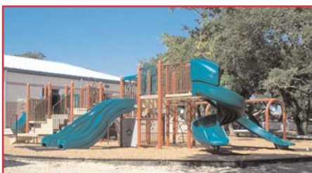
Bee Caves Elementary

The additions to the Lake Pointe Elementary, Lakeway Elementary, and Bee Caves Elementary schools were completed in July 2004 after only six months of work. A total of fifty one new classrooms were added as well as play grounds,