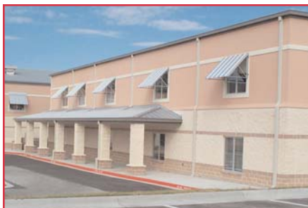
Lake Pointe Elementary

and the steel shortage, American Constructors, was able to meet our needs and deliver on their commitment."