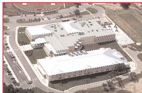
Canyon Ridge Middle School